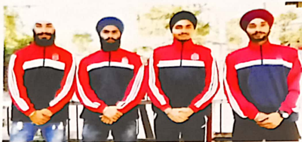
Students of the college who represented Jammu University in the Inter-University Hockey Championship held at MDS University Rohtak