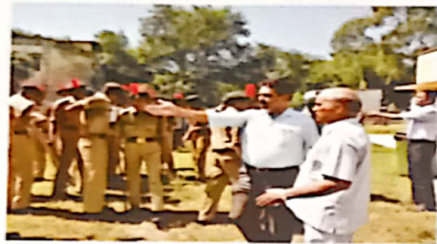
NCC Cadets launch cleanliness drive