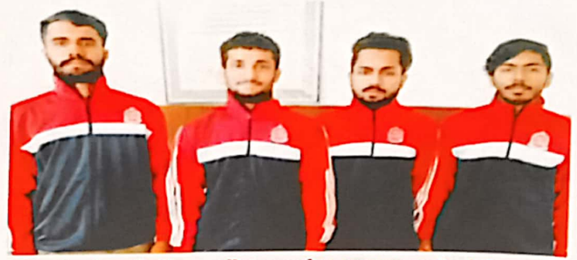
Students of the college who represented Jammu University in the Inter-University Taekwondo Championship held at PU, Chandigarh