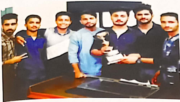
Winners of Jammu University Inter-collegiate Judo (Men) Tournament

College students bring laurels by winning 1 gold, 2 Silver and 4 Bronze medals in Inter-Collegiate Judo (Women), 6 Silver and 2 Gold medals in Inter-collegiate Judo (Men) and 2 Gold, 2 Silver & 2 Bronze medals in Inter-collegiate Wrestling (Men) Tournaments organised by University of Jammu during the session 2017-18