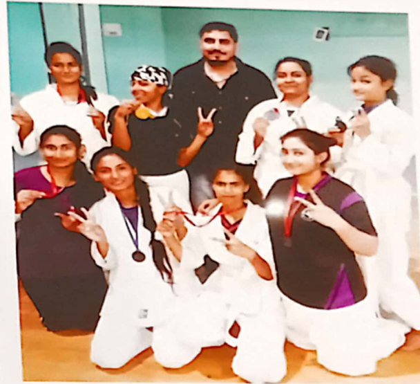
Runner-ups of Jammu University Inter-Collegiate Judo (Women) Tournament