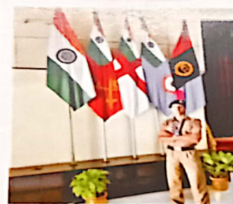
NCC Cadet attends Thal Sainik Camp at Amravati