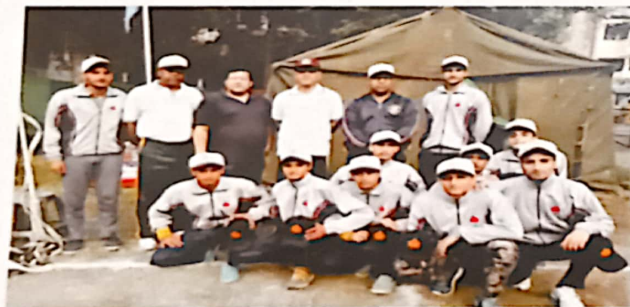
NCC Cadets at Trekking Camp at Nainital