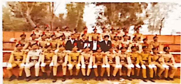
NCC Cadets of 2nd J&K Girls Bn and 1 J&K Armd Sqn who participated in Republic Day Parade at Sports Stadium Kathua on 26th Jan. 2018