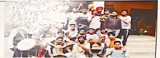
Hockey Team of the College attended Jammu University Inter-collegiate Hockey (Men) Championship 2017-18