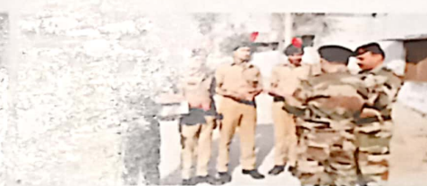
NCC Cadets of 1 J&K Armd Sqn participating in a rally against drugs