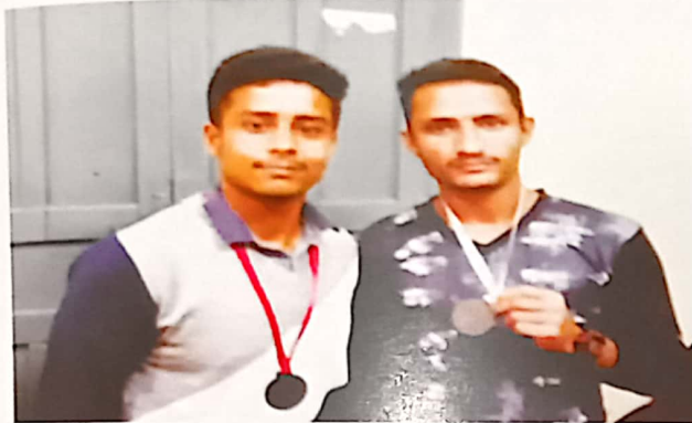
Members of Wrestling Team posing with their Medals won in Inter-collegiate Wrestling (Men) Tournament 2017-18