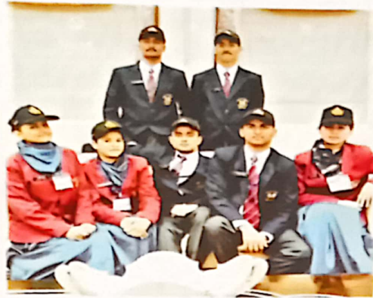
NCC Cadets of Govt. Degree College Kathua who participated in Republic Day Parade at New Delhi on 26th Jan. 2018