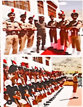
NCC Cadets of GDC Kathua participated in the Special National Integration Camp (SNIC) organised by the National Cadet Corps (NCC) Directorate of J&K at Leh, Ladakh and was inaugurated by Governor NN Vohra